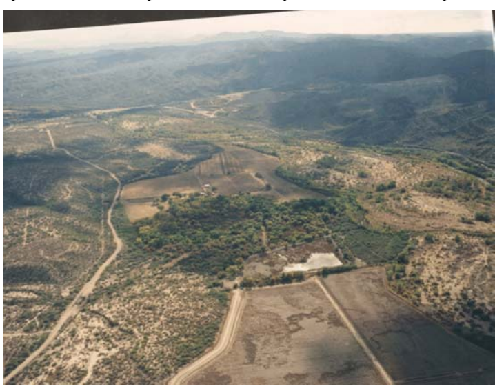
Aerial view of Cook's Lake.

The parcel and the surrounding area had been identified by members of the Science Technical Advisory Team for the Sonoran Desert Conservation Plan as an area with high biodiversity. Three important habitat elements were present in the area (1) limestone habitat that supports unique and rare caves as well as endangered or sensitive cacti,(2) riparian vegetation that provides important habitat for migratory songbirds, and (3) a large block of unfragmented habitat that serves as an important corridor for plants and