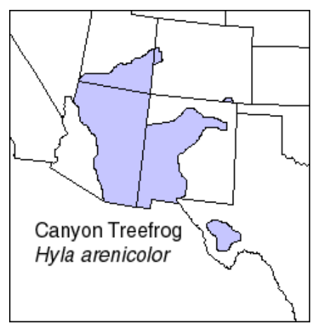
Canyon treefrog photo and U.S. distribution map are from the USGS's Online Checklist of Amphibians and Identification Guide found at http://www.npwrc.usgs.gov/narcam/idguide/.

Canyon treefrogs are riparian obligate species, never far from the vicinity of water. They live along temporary, intermittent, and permanent streams, springs, arroyos, rocky canyons, and tinaja pools. If water, large boulders, and bedrock pools are present, canyon treefrogs are likely living nearby. But to find one you'll have to be observant. In riparian areas they're often found clinging to the vertical face of a boulder, tucked inside a rock crevice, or on a tree trunk or