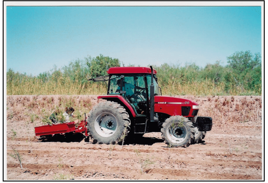
Figure 1. Tree Planter at Imperial National Wildlife Refuge

1995, has been reactivated. The Committee consists of FWS, Bureau of Land Management, USBR, Arizona Game and Fish Department (AGFD), Arizona State Parks, Arizona Department of Water Resources, Corps of Engineers (CE), City of Scottsdale, and The Nature Conservancy. The Committee's original task was to develop recommendations on operations of Alamo Reservoir to sustain recreational and habitat needs on the Bill Williams River. The Committee was reactivated through efforts of FWS and AGFD to address unresolved issues from the work in the 1990s. The Committee may begin the process of developing a watershed initiative and will need to fill the remaining scientific data gaps, address adaptive management strategies, consolidate all previous biological studies, complete photo interpretation from the 1920s to present, and deal with instream flow issues. The Committee is early in the decisionmaking process. The Refuge also conducts the typical transects for birds, mammals, plants,