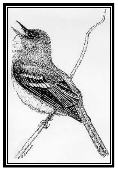
Figure 1. Southwestern willow flycatcher.

forests in the Southwest (core of its range includes Arizona, California, New Mexico, and