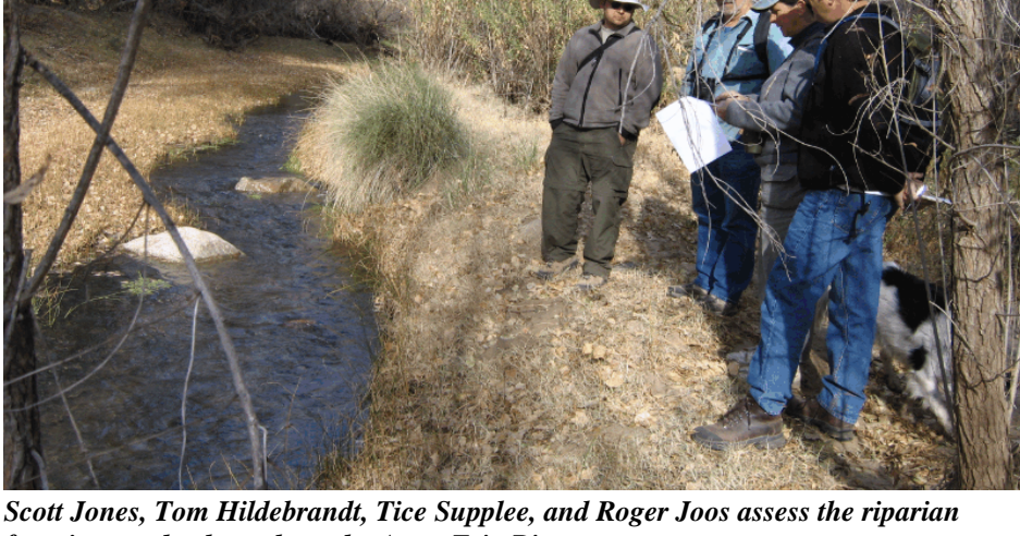
functions and values along the Agua Fria River.