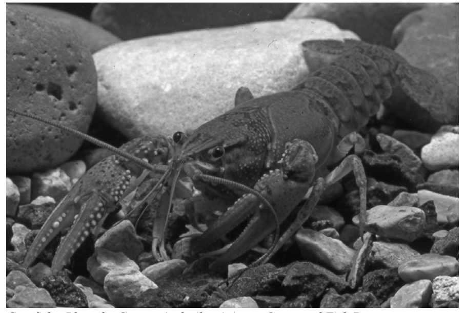
Crayfish

The AISAC recognized that this definition is pretty broad and open to even broader interpretation. They provided the proviso that it was not intended