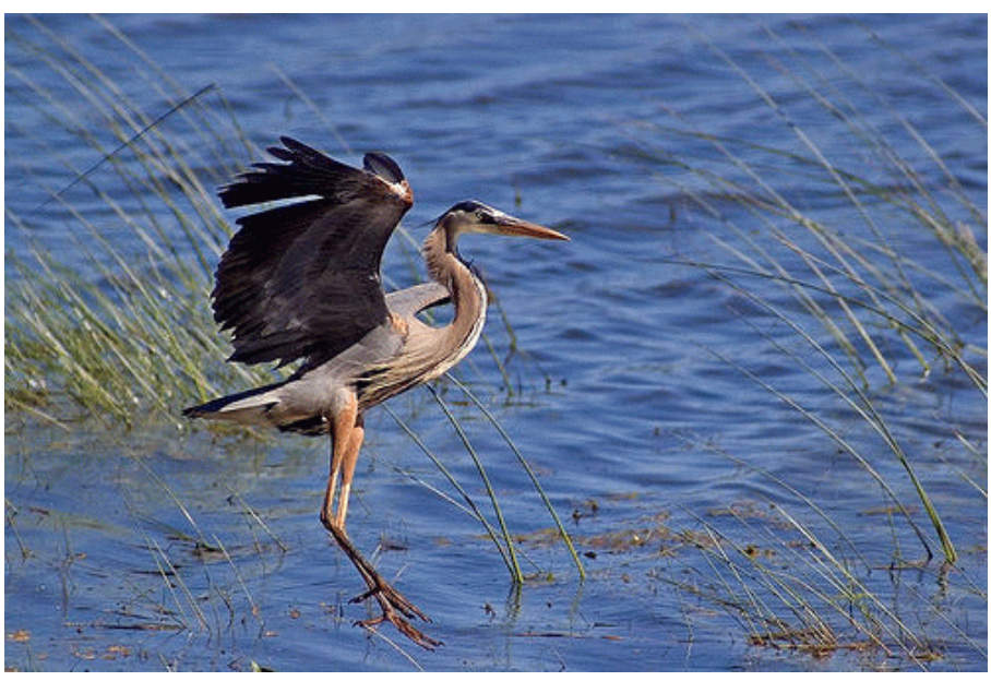
Great Blue Heron.

Great Blue Herons are found along lakes, rivers, permanent streams, marshes, impoundments, stock tanks and even canals. They build individual nests along the water's edge in the upper levels of deciduous trees though frequently many nests are grouped together in colonies called rookeries. Some rookeries may even contain several bird species. Nests are large, flat and made of interwoven sticks and lined with twigs, leaves and pine needles. Eggs are pale bluish