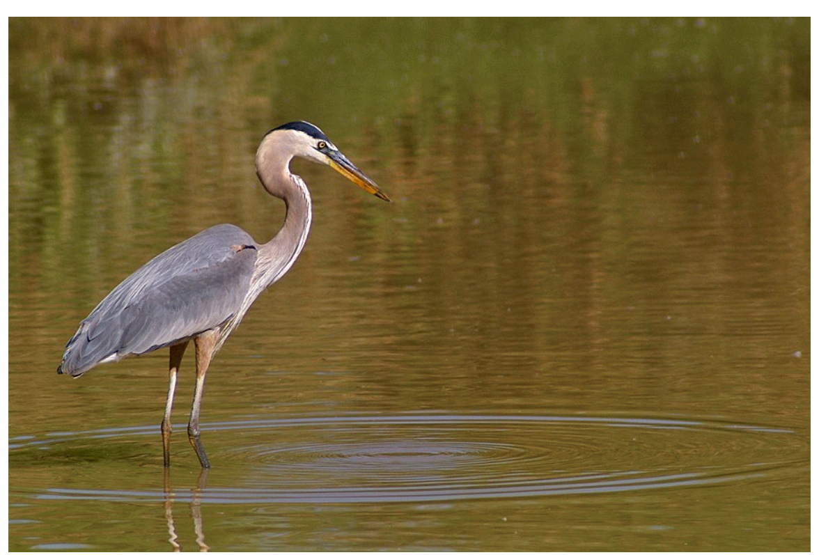
Great Blue Heron.