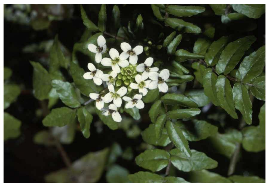
Photo by Robert H. Mohlenbrock @ USDA-NRCS PLANTS Database / USDA NRCS. 1995. Northeast wetland flora: Field office guide to plant species. Northeast National Technical Center, Chester.

The benefits of watercress are far greater than the risks and using watercress in a salad or as garnish is worldwide. England made watercress sandwiches famous in the 19<sup>th</sup> century as part of the working class diet. They were