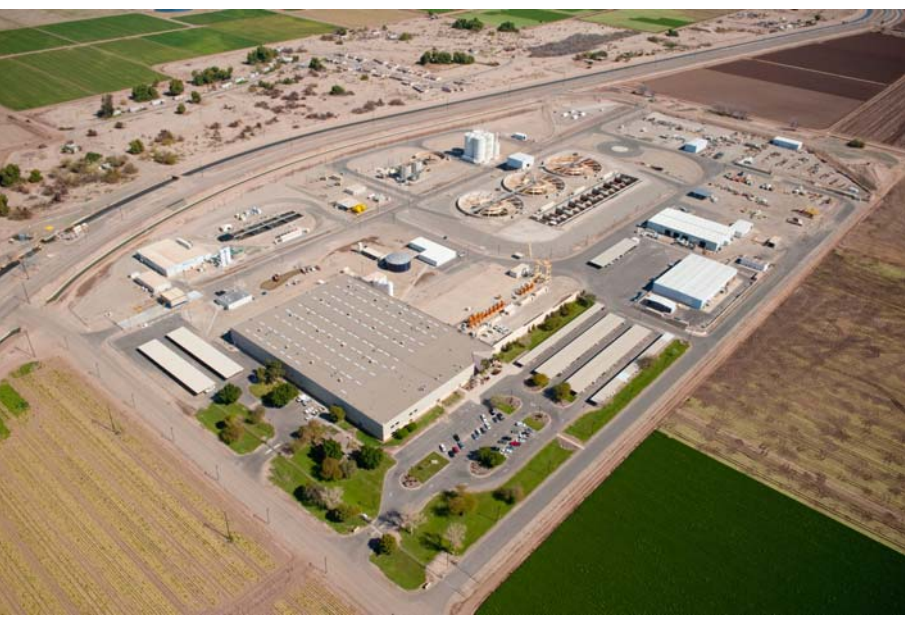
Aerial photo of the Yuma Area Office and the Yuma Desalting Plant.

Why the YDP exists requires a brief discussion of the "Law of the River." In 1922, Congress ratified the Colorado River Compact, which allotted 7.5 million acre-feet (maf) of Colorado River water to the "Upper Basin" states of Wyoming, Colorado, Utah, and New Mexico, and 7.5 maf to the "Lower Basin" states of Arizona, California, and Nevada. The 1922 Compact also recognized that the U.S. would need to negotiate with