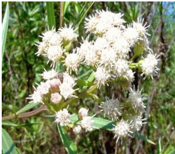
Male flower head.

Seep willow occurs in wet soil habitat throughout Arizona (see distribution map). Its wide spreading root system and tendency to form thickets make it ideal for erosion control. The abundance of this species in Arizona probably makes it highly under appreciated. However, seep willow plays an important role in many riparian vegetation communities. They trap sediment during flooding which provides crucial substrate for recruitment of many types of seedlings. While the cottonwoods ( Populus spp.), willows ( Salix spp.), sycamore ( Platanus spp.), and other riparian trees can inspire with their height and beauty, many would not exist if not for the shrubby seep willow.