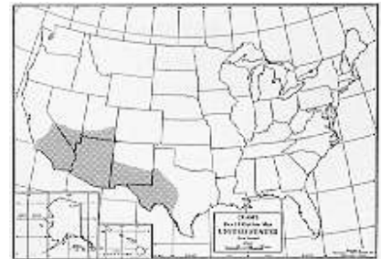
Baccharis salicifolia U.S. distribution map.

through October. The flowers are mainly bee-pollinated but can be seen swarmed with a variety of insects taking advantage of the nectar and pollen rewards. The female flowers mature into fruits consisting of a tiny achene (seed) dispersed with the help of a ring of bristly pappus to help it stay airborne. Seep willow and other Baccharis species such as desert broom ( Baccharis sarothroides ) can appear to be exploding with white fuzz in their later stages of flowering.