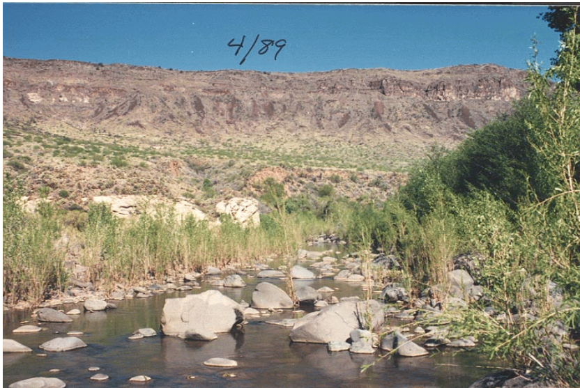
Picture 2. Burro Creek in 1989, showing channel changes after six years.