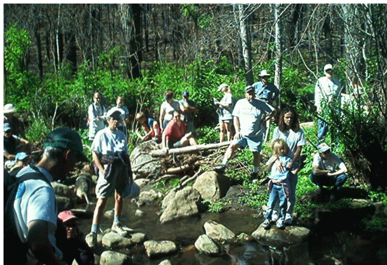
Field trip to Canyon Creek at Fall Campout and Get-Together, September 22, 2002.