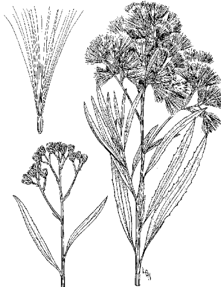
Top left clockwise: achene with pappus, female flowering head, male. From An Illustrated Guide to Arizona Weeds (Parker 1972).

rounded while female flower heads are more slender. The differences are noticeable if you have flowering branches from male and female plants to compare. There may be as many as 150 individual flowers in one female flower head. Seep willow normally blooms from March