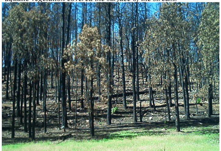
Burned stand of ponderosa pine about 100 yards from Canyon Creek.