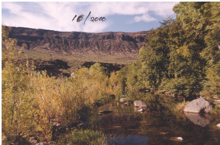
Picture 3. Burro Creek in 2000 after 17 years of intensive livestock management. Notice the dramatic increase of vegetation, presence of water and the development of an active channel.