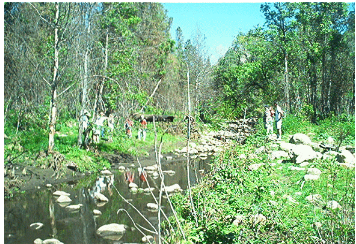
Canyon Creek downstream from hatchery. Before the fire the aquatic vegetation covered the surface of the stream.