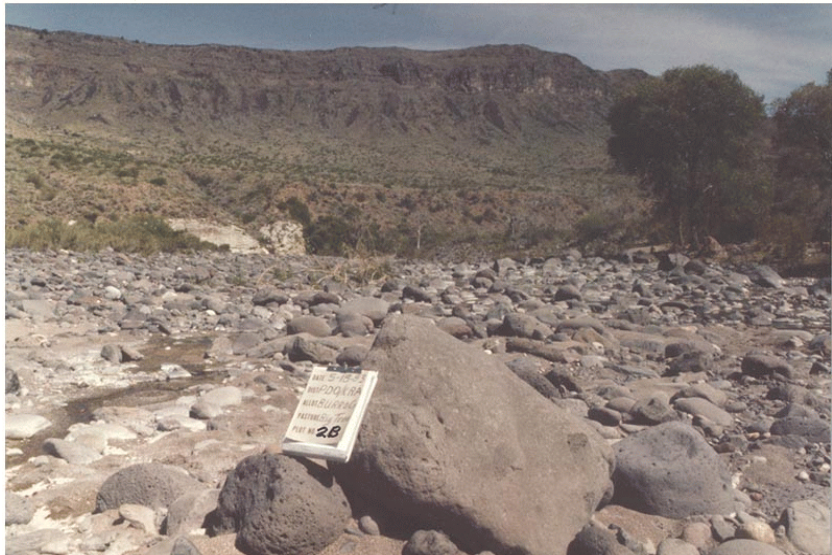
Picture 1. Burro Creek in 1983 at the time of change in livestock use.

The Safford Field Office, as previously discussed, has been actively managing riparian areas since the early 1980's. Aravaipa Creek and Gila River riparian conditions have improved significantly. Conditions within the San Simon channel and watershed have show significant improvement since the major flooding and channel incision in the late 19th century. Riparian areas have developed behind erosion-control structures and the channel is stabilizing. Safford manages the Gila Box Riparian National Conservation Area which was designated in November 1990 by